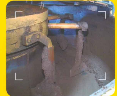
Before and After Jetwash System Cleaning